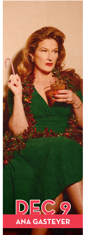
DEC 9 ANA GASTEYER