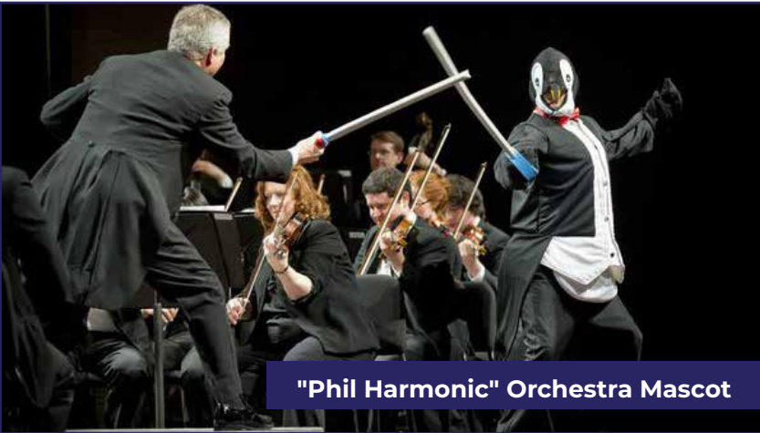
"Phil Harmonic" Orchestra Mascot