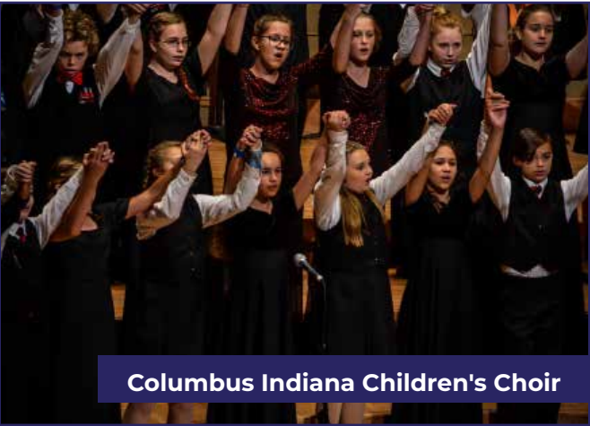
Columbus Indiana Children's Choir